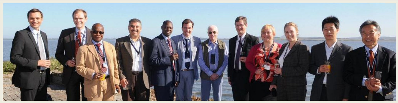
Meeting of the INC Bureau with the artist Nicolás García Urriburu. Punta del Este, Uruguay