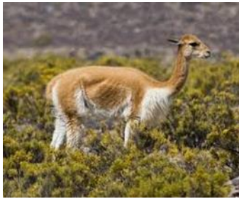
Vicuña Vicuña vicugna