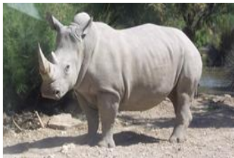
Southern white rhinoceros Ceratotherium simum simum