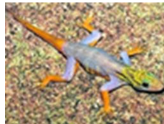
Reptiles, amphibians and snails Psychedelic rock gecko