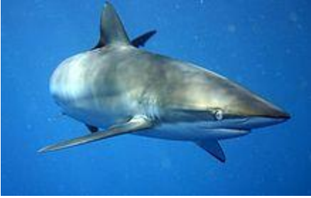
Silky shark Carcharhinus falciformis