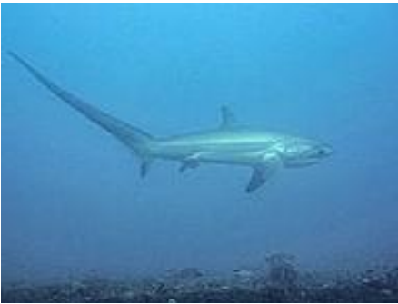
Thresher sharks Alopias spp. (3 species)