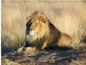
Lion Panthera leo