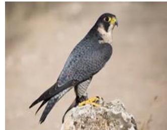
Peregrine falcon Falco peregrinus