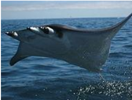
Devil rays Mobula spp. (9 species)