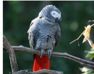
African grey parrot Psittacus erithacus