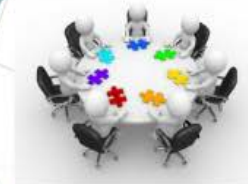
Group of Experts