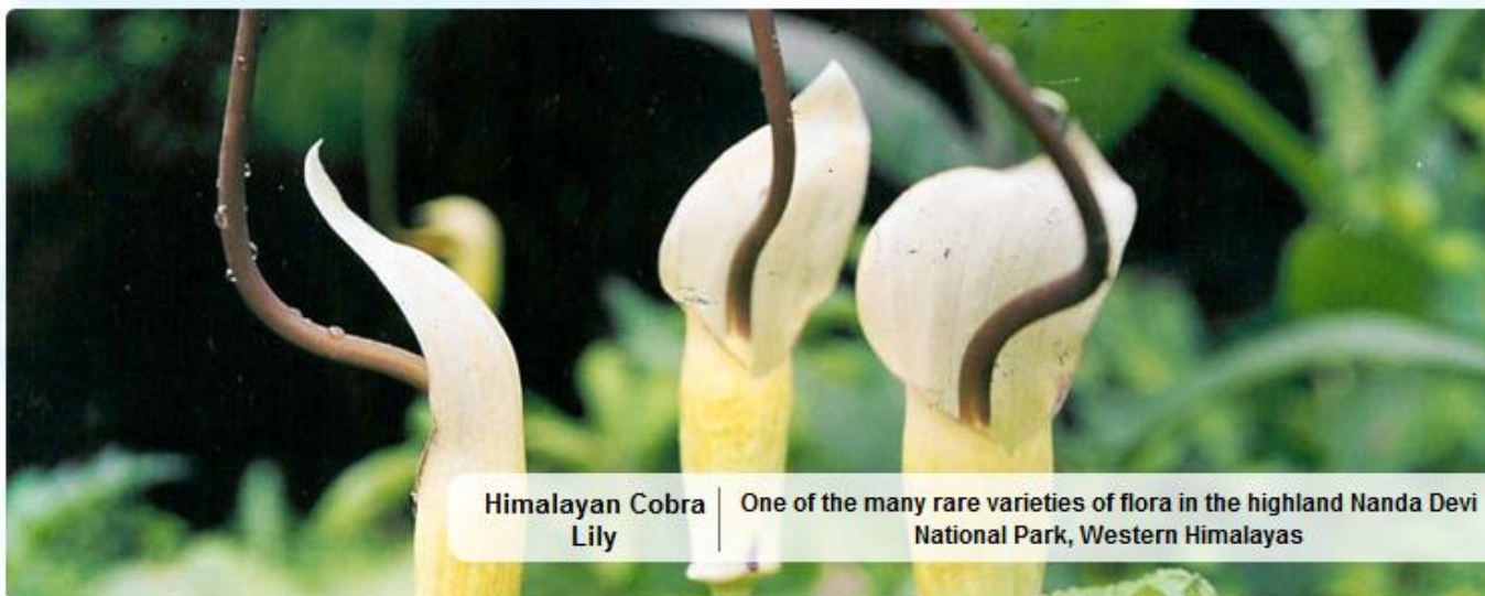
Himalayan Cobra Lily | One of the many rare varieties of flora in the highland Nanda Devi National Park, Western Himalayas