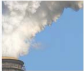
Air pollution and air quality