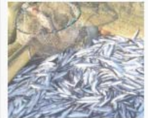
Oceans and seas