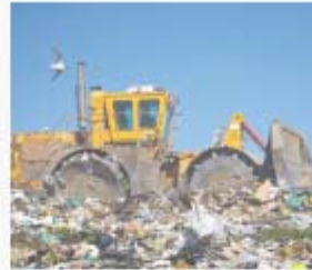
Chemicals and waste