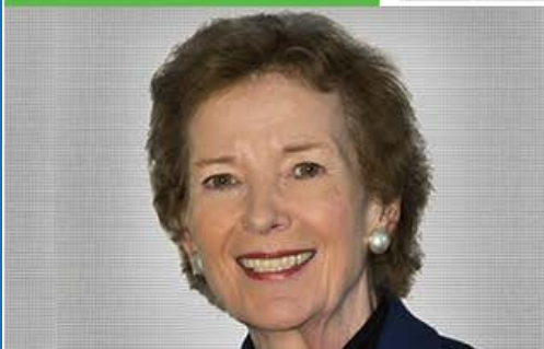
Mary Robinson Former President of Ireland