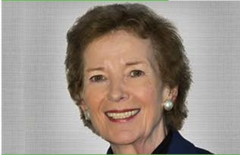
Mary Robinson Former President of Ireland