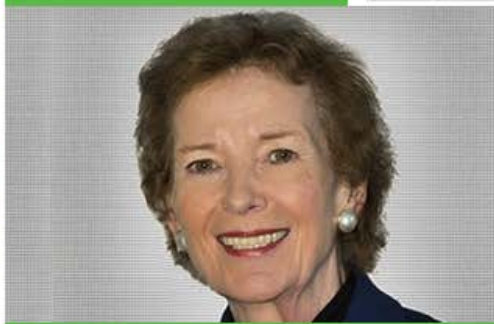
Mary Robinson Former President of Ireland