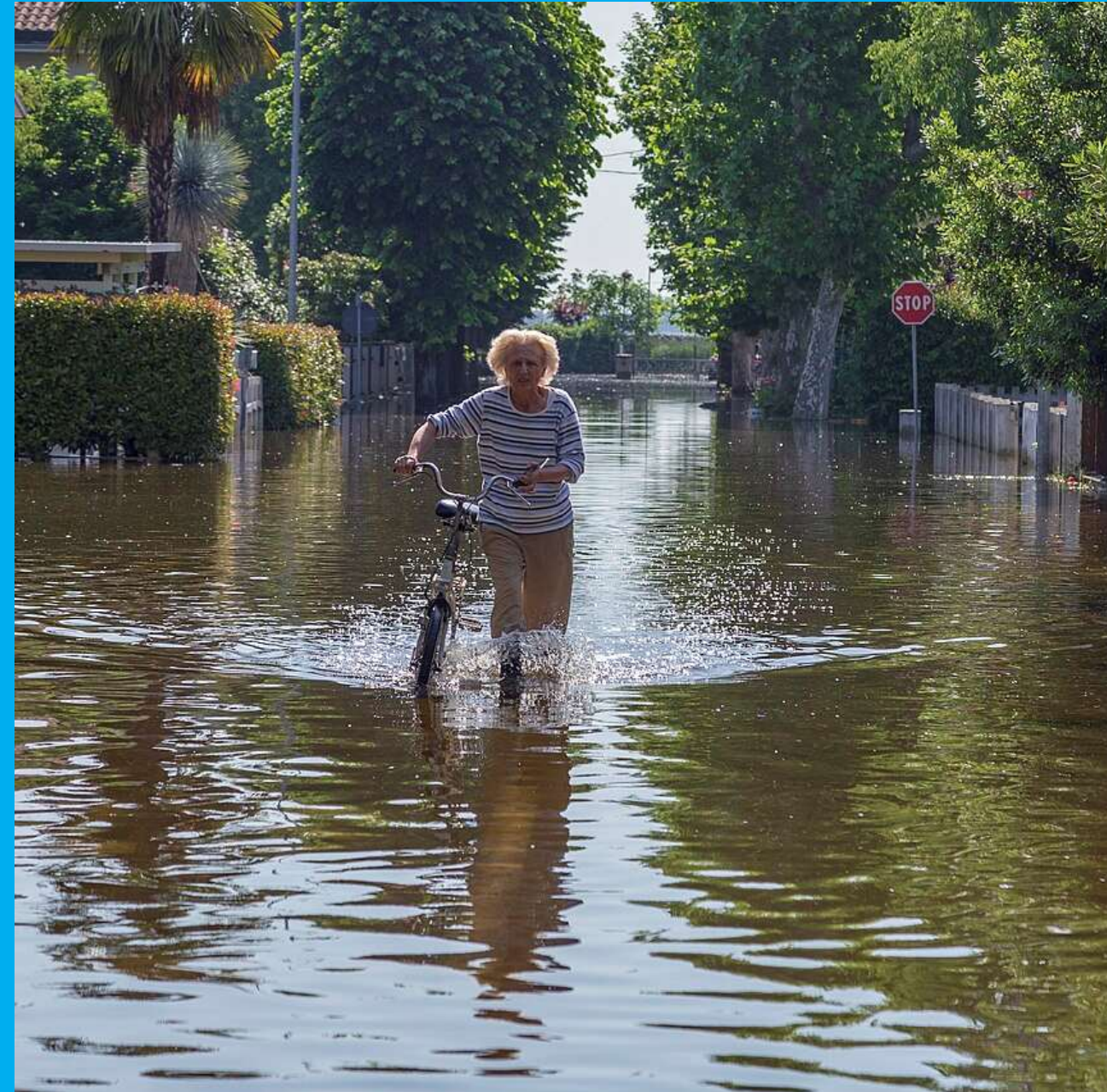
In bici tra il fiume d'acqua

Council of Europe, Environment and Human Rights (CDDH-ENV)